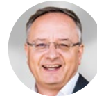
Andreas Stoch SPD