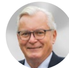
Bernd Gögel AfD